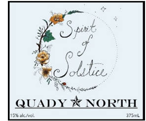
Spirit of Solstice Applegate Valley