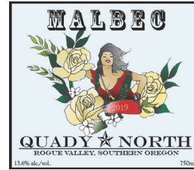
Malbec Rogue Valley