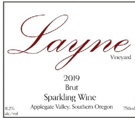
Brut Sparkling Layne Vineyard