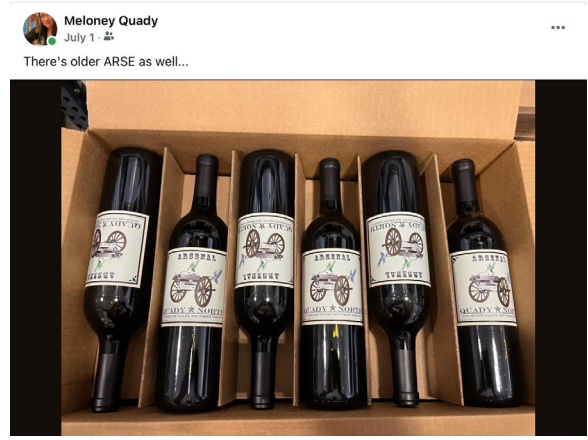
Look out for Library offerings of Arsenal.

We don't always pull out the Arsenal. Our Syrahs, Rose's, and blends certainly see a lot more time in glasses, but this is a wine that is near to the heart and one that generates a lot of pride. I like to think of this wine as one that lingers in cellars for some time, pulled out at Christmas dinner or Thanksgiving, alongside other very worthy bottlings. I'd like to think that it would impress more than one skeptic, would go well with stuffing, and live up to the lamb.