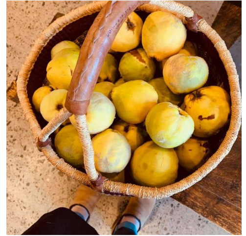
Quince harvest from prior years.

Our Spirit of Solstice is an infused wine made with cinnamon, cassia, clove, orange peel and ginger. It was inspired by a wine that I made for friends and family when I was a student at Fresno State. This year, on the Saturday after Thanksgiving, I had one of my favorite moments of the holiday, with my oldest daughters home from university, we enjoyed a glass of Solstice, and ate cheese, pie, and membrillo late into the evening over a highly contentious game of Catan.